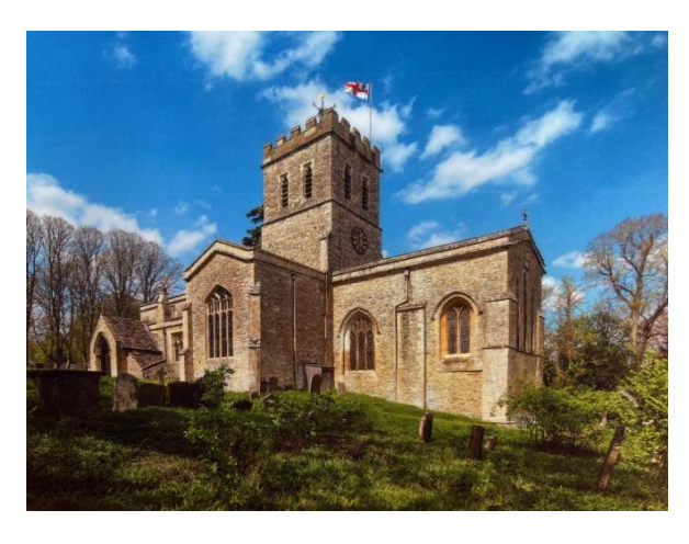
St Nicholas, Tackley