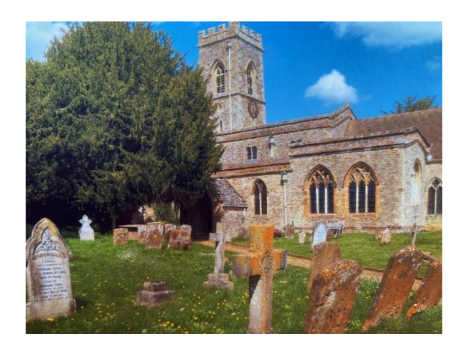
St Mary's, North Aston