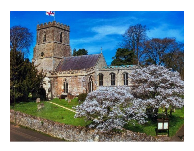
SS Peter & Paul, Steeple Aston