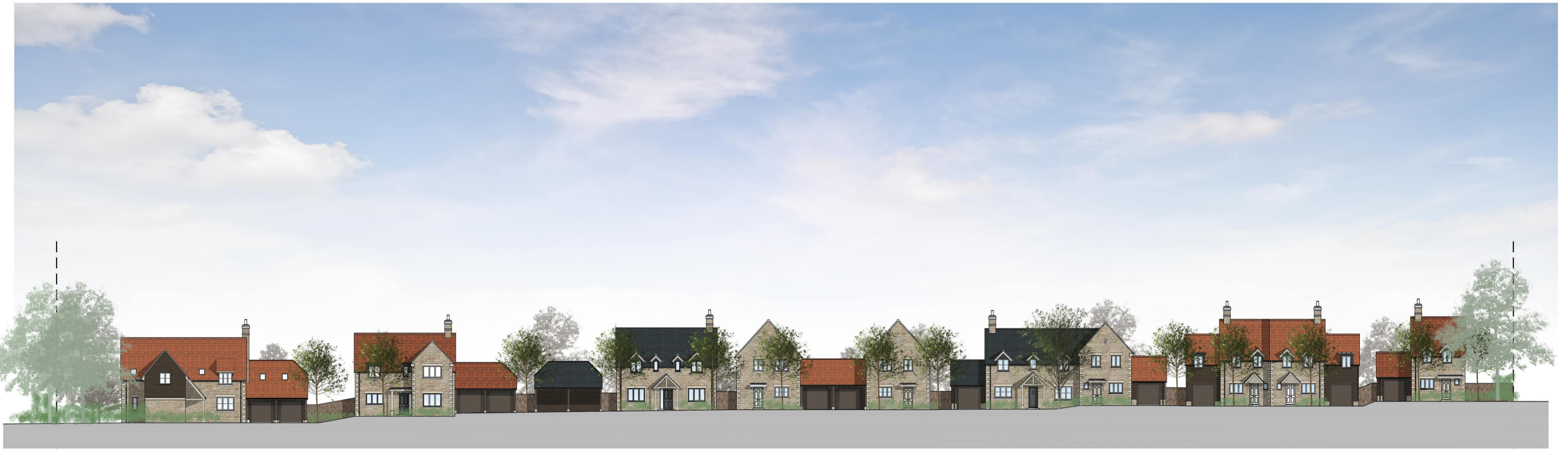
Street Scene from on site road